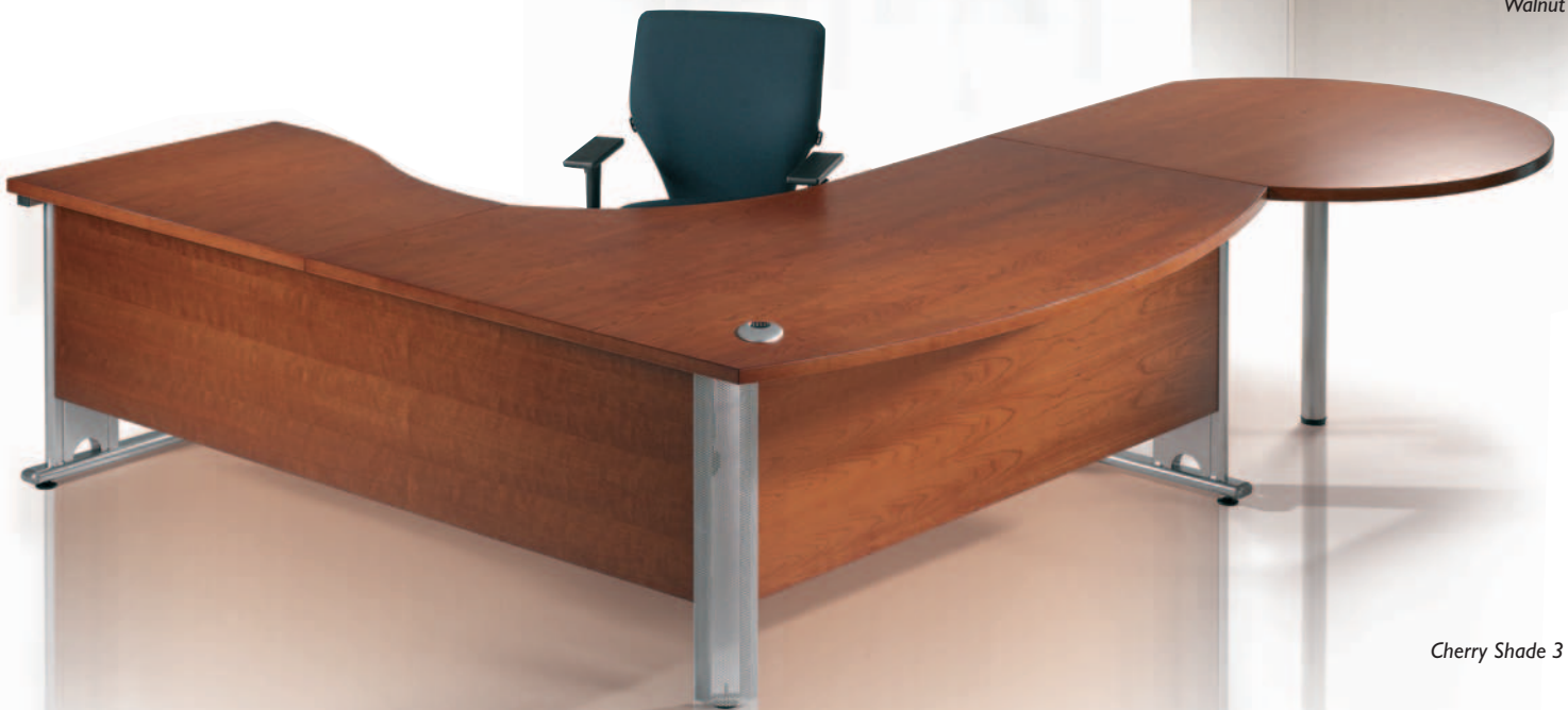
Cherry Shade 3

Adding a desk-end teardrop table creates a more versatile managerial desk that offers extended working space and a convenient area for small or informal meetings. The chrome cantilever supports, together with the linked table and the sweeping bow front of the desk, have an imposing quality that makes this configuration unmistakably managerial.