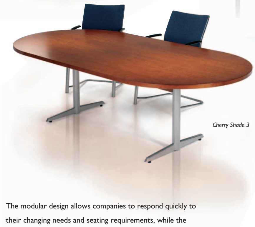
Cherry Shade 3

For a more versatile area, modular tables are offered with rectangular, semi-circular, trapezoidal or 90° annular tops enabling furniture to be easily combined, forming an endless number of configurations.