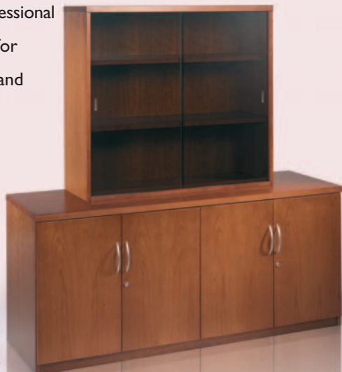
Cherry Shade 3

Hinged door storage, coupled with a sliding glass door bookcase, combines practical storage with a professional display area, ideal for managerial offices and executive areas.